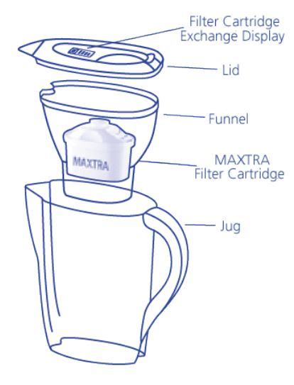
BRITA Counter Top Filter

concerned with sustainability issues. That's why we think it's important to quantify the actual emissions from our production process as exactly as possible." In order to gain a detailed analysis of the domestic market, the company limited the geographic boundary to its production in Germany for the initial eco-balance.